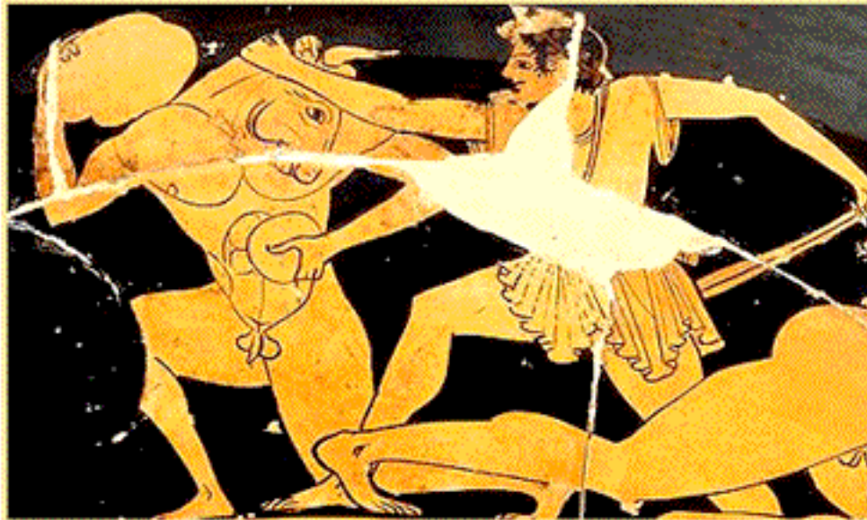
T34.2 Theseus & the Minotauros

Clearly we can see from the above pictures all three aspects of the Cherubim presented in physical form. These creatures were born of Cherubim angels and human women. Note too that they have normal looking reproductive organs. The flood came to wipe out all the giants and "beasts" from the land, but after the flood the Shining Ones came down once again and began to repopulate the earth with beasts and giants once again.