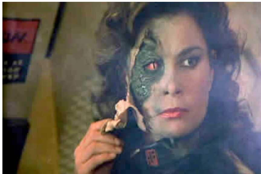
Land of the Lost 1974 .....V the movie 1983

In the movie V the Reptilians wore orange uniforms. Not what if they wore business suits instead! Well as a matter of fact they do. During his campaign live on TV, Al Gore suddenly began to shape shift. His face began to turn green, his ears sharpened, and his eyes began to change. Then just as fast as he transformed he snapped back to his human