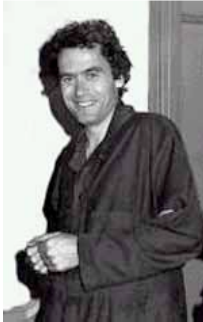
Serpent Seed Ted Bundy

Look at serial killer Ted Bundy. He was so clever and charming, yet he burned with hatred of women inside. Inside he was infested with alien demons. If he had never been caught for the murders he committed, people would still think that he was a wonderful human being. His victims were viscerously murdered showing extreme hatred for them.